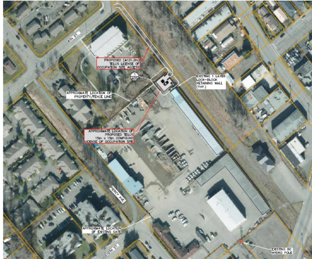
Aerial 1: Proposed location of 15m x 15m compound and site access from 8<sup>th</sup> Street