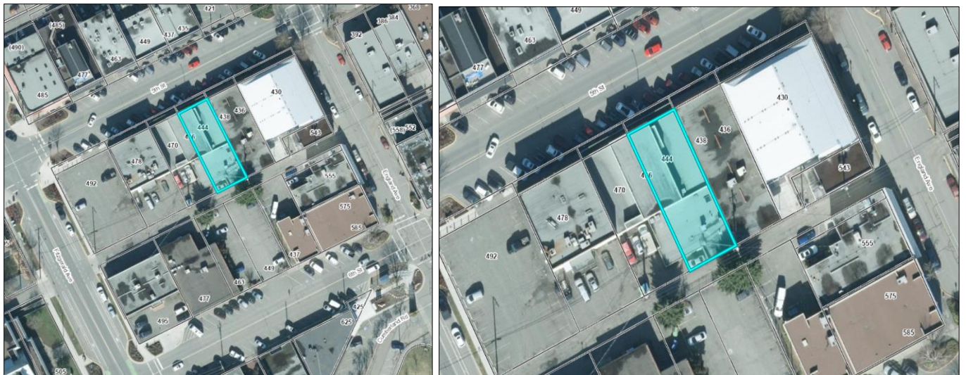
Figure 1: Site Location and Context

The proprietor requests a patron participation entertainment endorsement to the existing Food Primary licence for a 110-person capacity (70 persons inside the building and 40 persons on the patio once installed). If approved by the LCRB this would allow the establishment to host entertainment activities such as trivia night, speed dating, and dancing, within the Food Primary licenced area, illustrating in Figure 2 (highlighted by red lines).