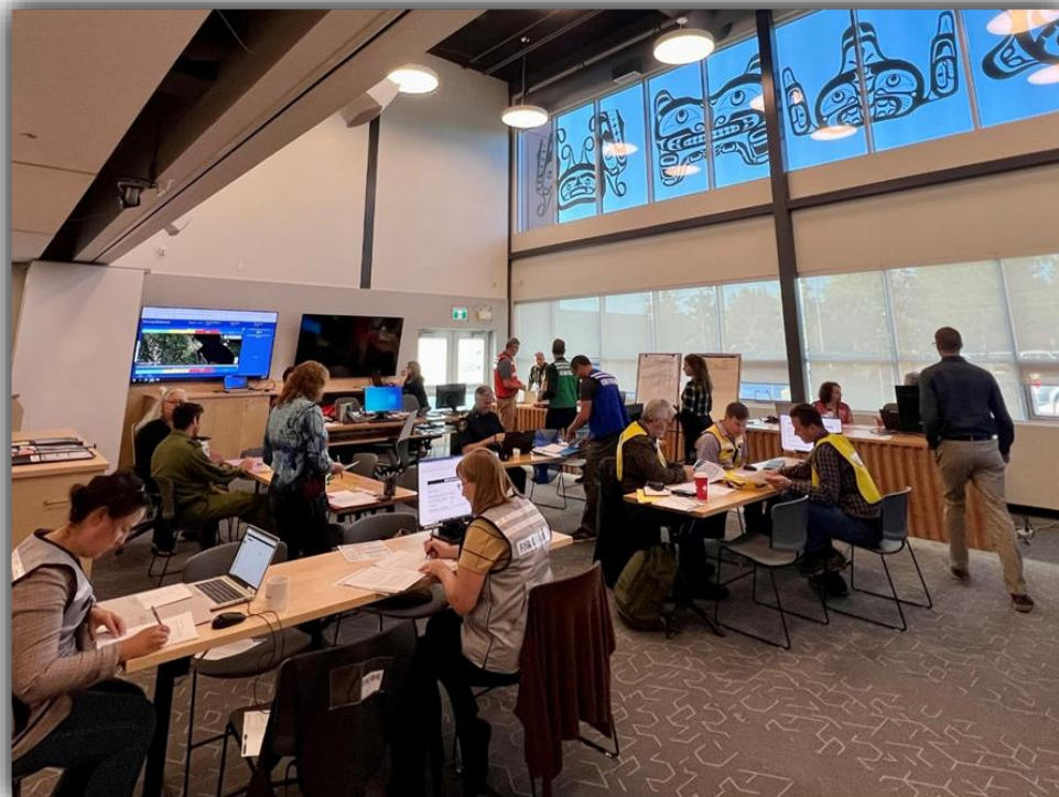
Fracture on 5 th Regional Exercise