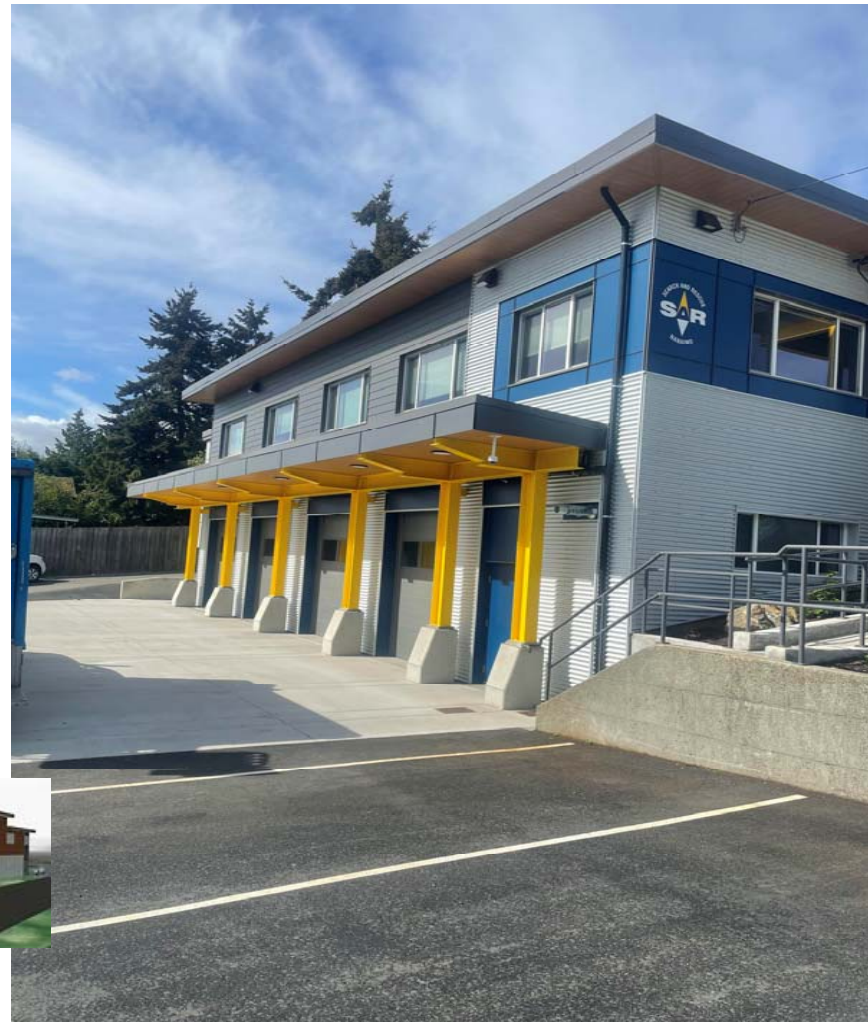
Nanaimo SAR Opened 2022