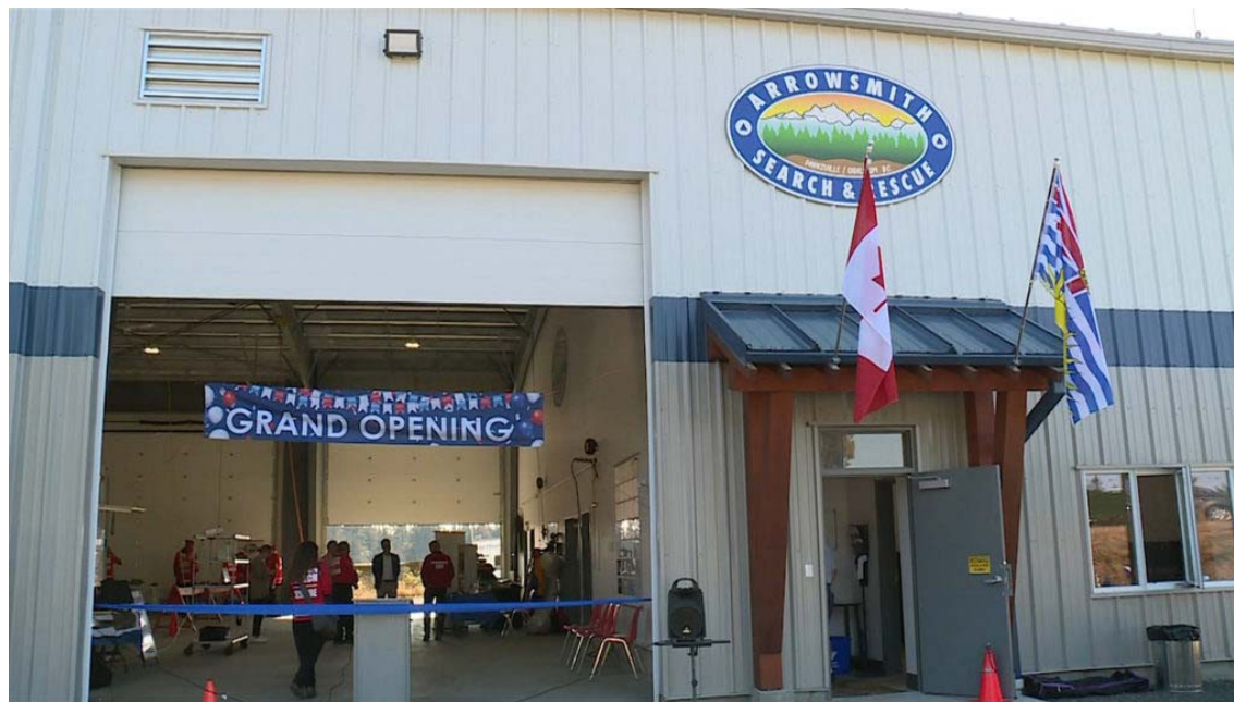
Arrowsmith SAR Qualicum Airport Opened 2022