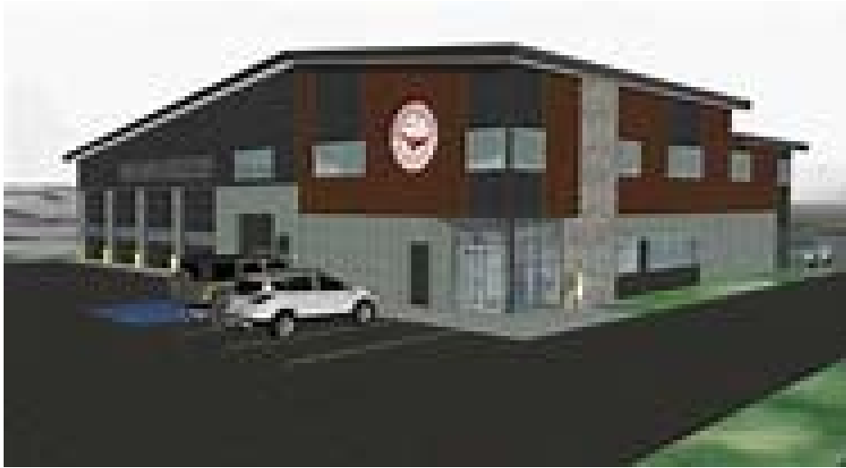
Vernon SAR –Opening Spring 2023