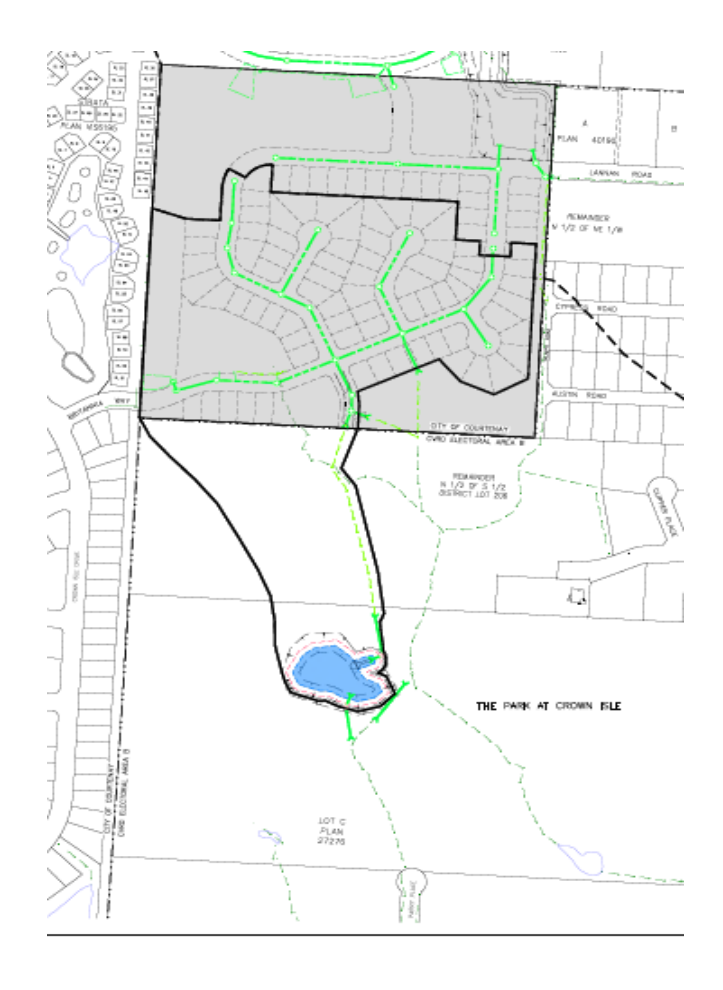
Figure 6 Koers & Associates Engineering Ltd September 1, 2020 Rev.1