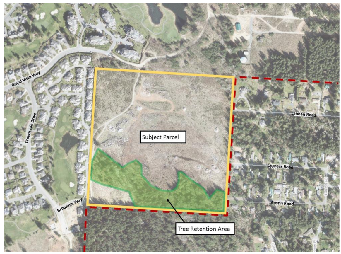
Figure 4 Tree Protection Area from April 6, 2020

Concern over the existing trees and protecting them was identified in staff reports and Council resolutions. This area has been defined as per Council Resolution on April 6, 2020 and is noted in Figure 4 Tree Protection Area. This protected area will be addressed in the Development Agreement as a section 219 covenant.