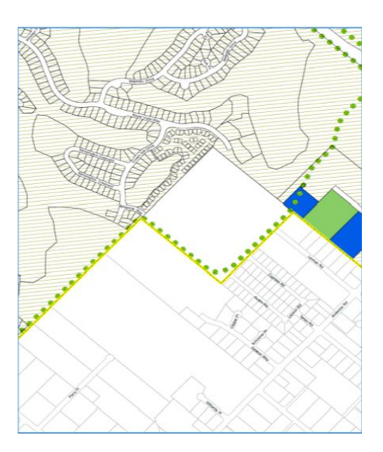
Figure 3 Greenway Trail

The OCP Bylaw No. 2387, 2005 policies required integration of greenways and the inclusion of pedestrian walkways with any subdivision and developments to link residences to public facilities, transit, parks, and neighbourhood amenities. Dedication of buffer strips within properties prior to rezoning of land and/or use of section 219 covenants to provide for pedestrian trails and landscaped areas were required in addition to the 5% parkland dedication requirement under subdivision.