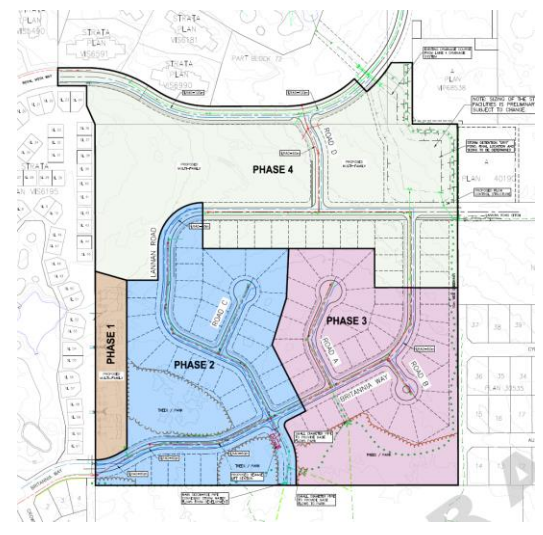
Figure 7 Koers & Associates Engineering Ltd Proposed Development Phasing

This report outlines the proposed development phasing plan that will inform the Development Agreement and the proposed development phasing plan provided by Koers is illustrated below (see figure 7):