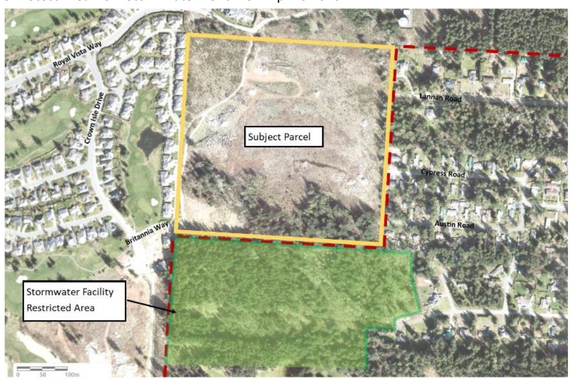
Figure 5 Protect Area from Stormwater Pond from April 6 2020

Staff will continue to work with the applicant's engineer and with relevant agencies through the design and construction period. The finalized report will be incorporated into the Development Agreement.