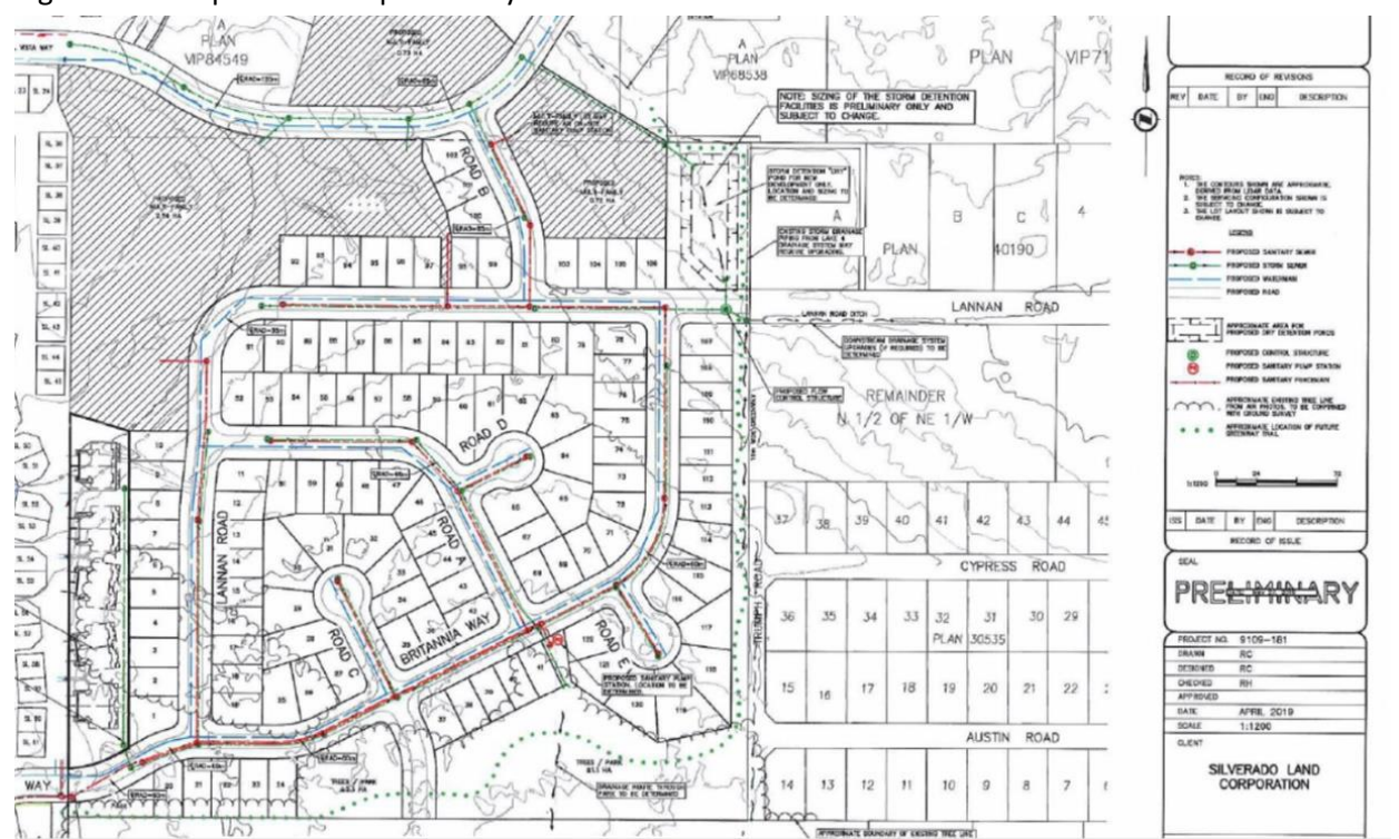
Figure 2 Conceptual Development Layout

The CD-1 J zoning limits total number of units to 330. The split is 122 Single residential dwellings units that are permitted to have secondary suites and 208 duplex or multi-family residential dwelling units. Minimum lot size was decreased from 465m2 to 400 m2. The Developer will have a section 219 covenant that will outline construction details that will include Step Code 3 or better, and will coordinate with infiltration designs for house and road ways to address stormwater management plan. This will include solar panels, EV chargers, bio-swales, infiltration trenches, drought resistant landscaping and native plants. See Figure 2 Conceptual Development Layout. Staff are satisfied that building Performance Standards are in alignment with recent changes to the BC Building Code which requires Step Code 3 for all Part 9 Buildings. The applicant has committed to encompass Step Code 3 or better specifications in the section 219 covenant. Staff are satisfied this resolution has been addressed and it will be addressed in the Development Agreement.