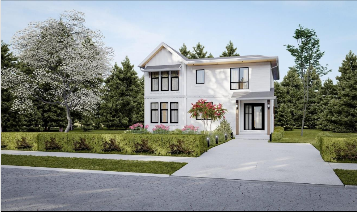
Figure No. 2: Exterior Rendering

Staff assess the requested variances as supportable, given the use is permitted and density has not been increased. These variances support the creation of a duplex unit on a lot size that can support this use and create infill housing in line with the OCP policies and Council Strategic priorities. Staff recommend the issuance of Development Variance Permit No. 2303.