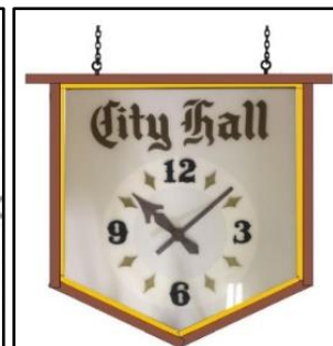
Figure No. 1: The Clock shown on the Old City Hall Building and a design selected to restore the original clock.

In April 2021 the HAC advised on the location of the clock after reviewing a number of options (Figure 2) including: