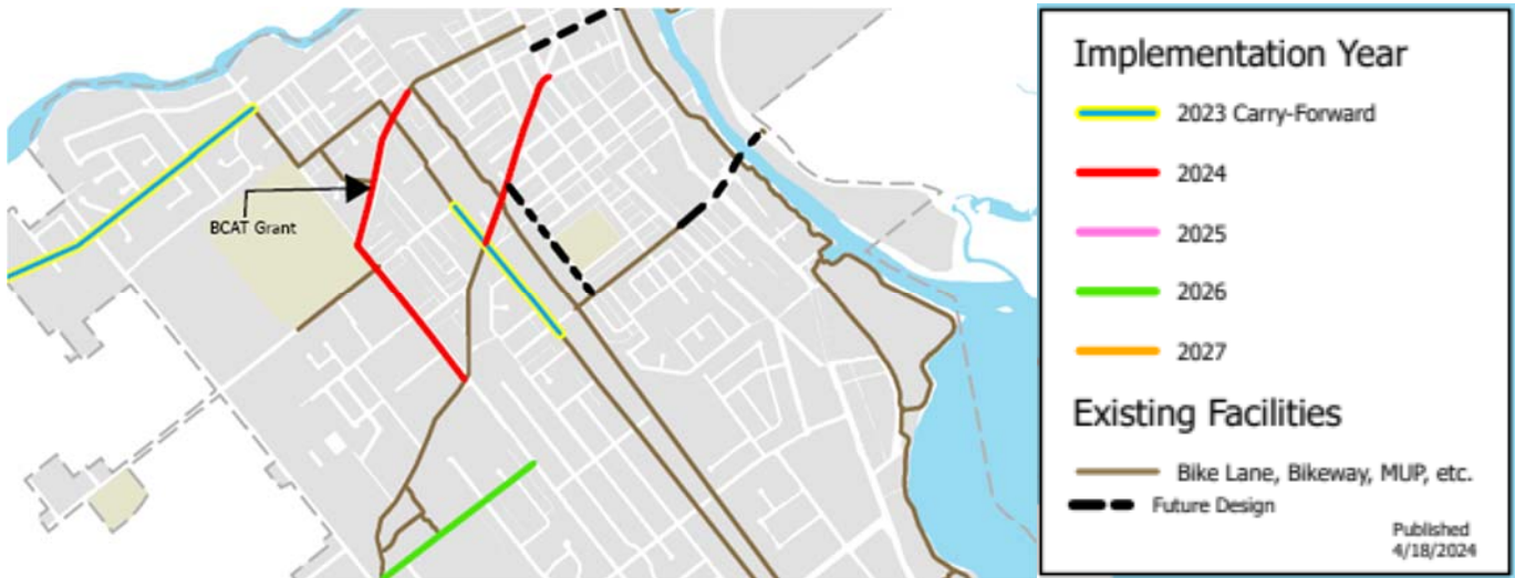
Attachment 3: CNP Interim Cross-Section