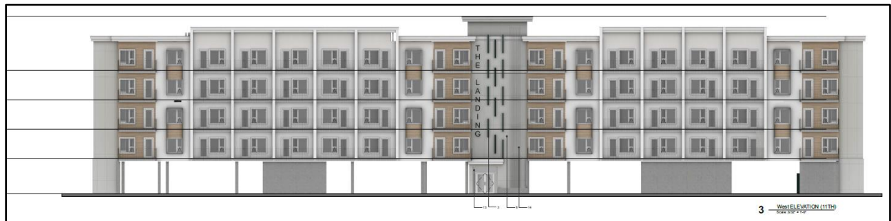
Figure 3 Proposed 4-storey Rental Apartment - West Elevation

Submission of the rezoning application was predicated on an understanding shared by the applicant and Staff, that any disposal of municipally owned land must follow the statutory framework set out in the Community Charter. Section 26 of the Community Charter requires notice of any proposed disposition. Where the land is not available to public, this notice must include the name of the person proposed to acquire the land, the consideration for the proposed disposition, and the terms of the proposed disposition. If the land is sold for less than fair market value, notice of this less than fair market value must be given also.