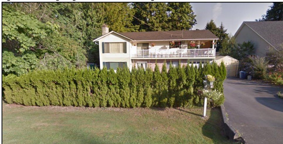
Figure 1. Existing Single Residential Dwelling.

In order to construct the addition and bring the dwelling unit siting into conformance, a variance is required to vary Section 8.1.15 (3) (side yard setback) of Zoning Bylaw No. 2500, 2007 from 3.5 m to 2.5 m.