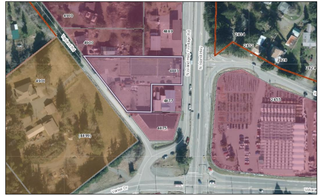
Figure No.1 – Subject Property

The subject property is designated Commercial in the Official Community Plan (OCP), zoned Commercial Two Zone (C-2) and is located approximately 15.0 metres from the North Island Highway. It is located in a primarily Commercial area, with limited residential in the near vicinity (See Figure No. 1).