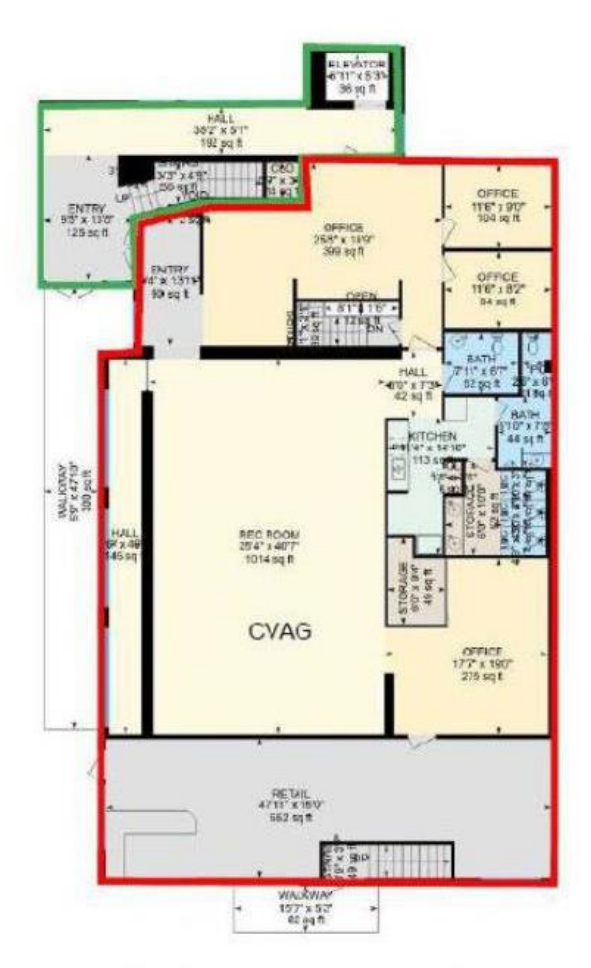
Main Floor Total Exterior Area 4138 sq ft Total Interior Area 3948 sq ft