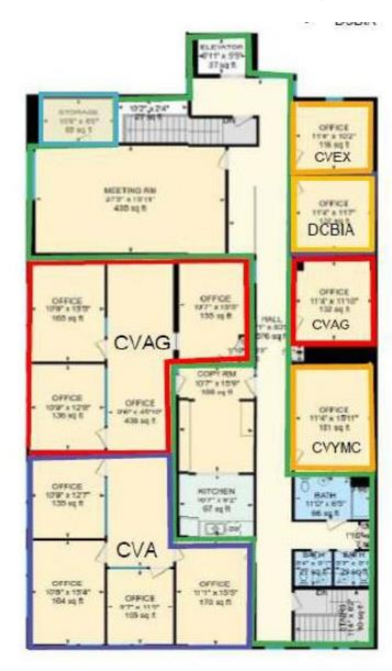
SCHEDULE B SOCIETY'S 2<sup>ND</sup> FLOOR EXCLUSIVE USE (OUTLINED IN RED) & COMMON AREAS (OUTLINED IN GREEN)

2nd Floor Total Exterior Area 4152 sq ft Total Interior Area 3963 sq ft