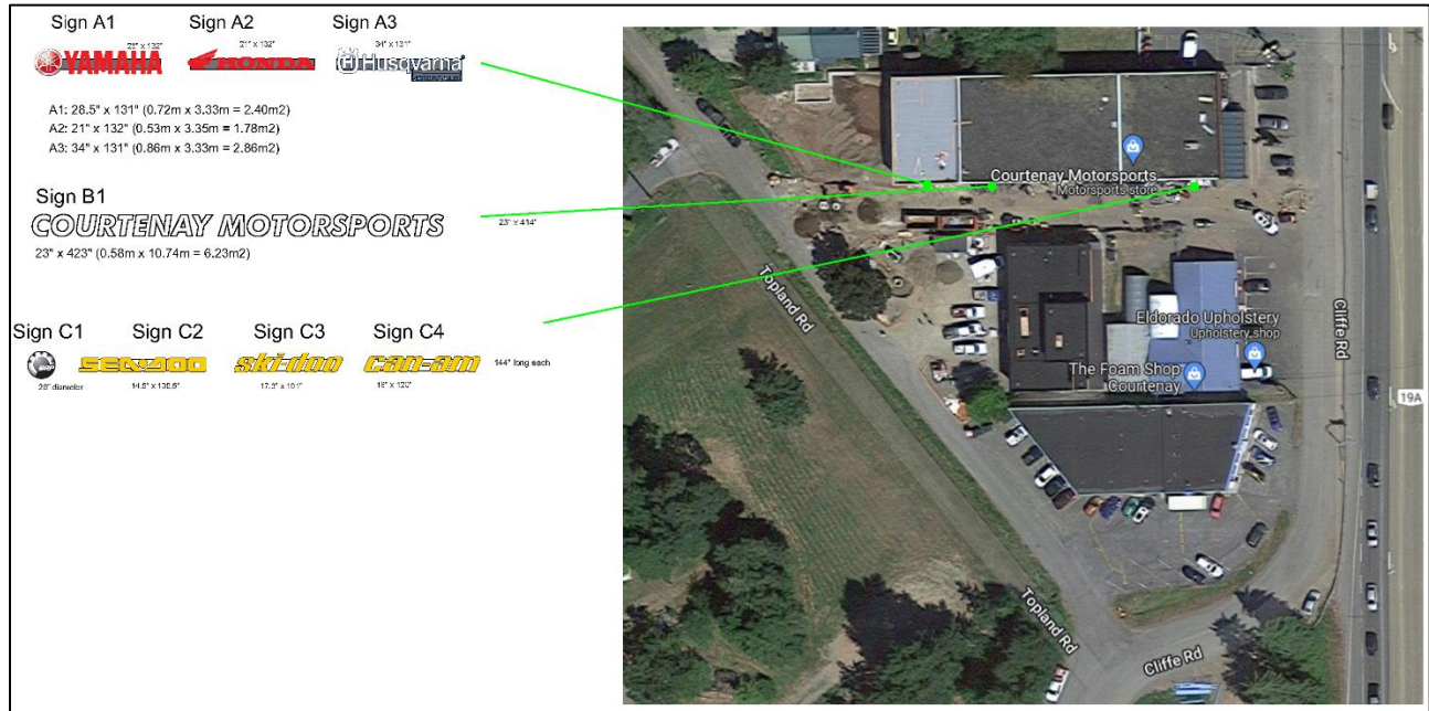
Figure No. 3 – Signage Locations

signs, centred over discrete entrances, proportionally integrated with the façade entrances and design, the signs do not appear excessive.